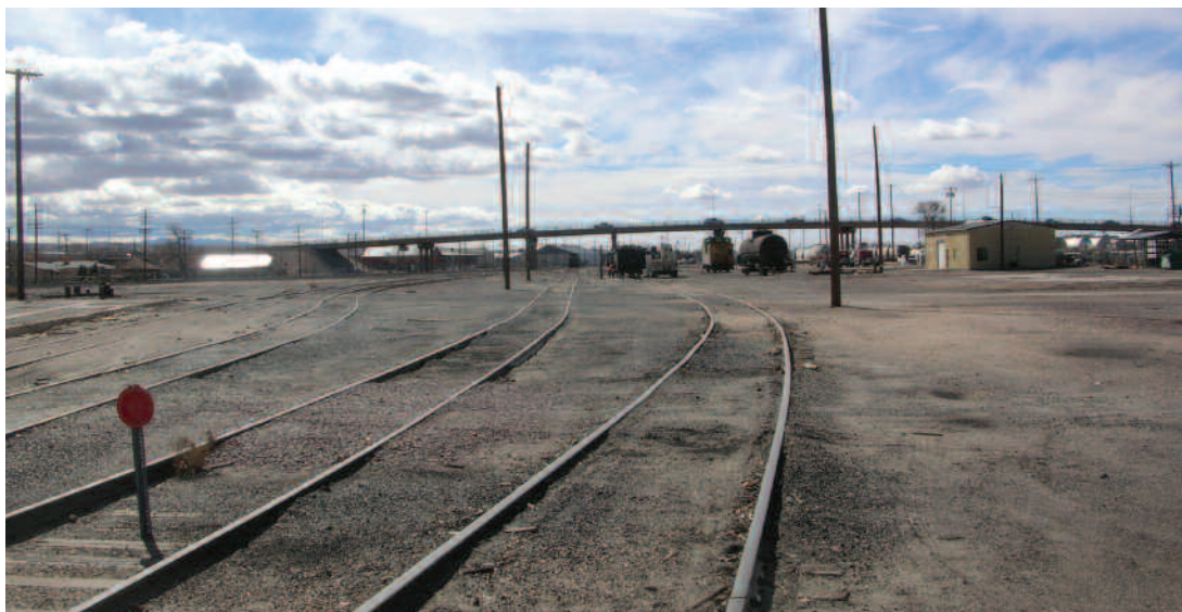
Before redevelopment, the city must address easements held by BNSF Railway, which, if not eliminated or at least clarified, could adversely affect successful revitalization of the rail yards.

care and include clear statements of operational and financial obligations to protect the city's investment and avoid subsequent, unintended subsidies of noncity operations.